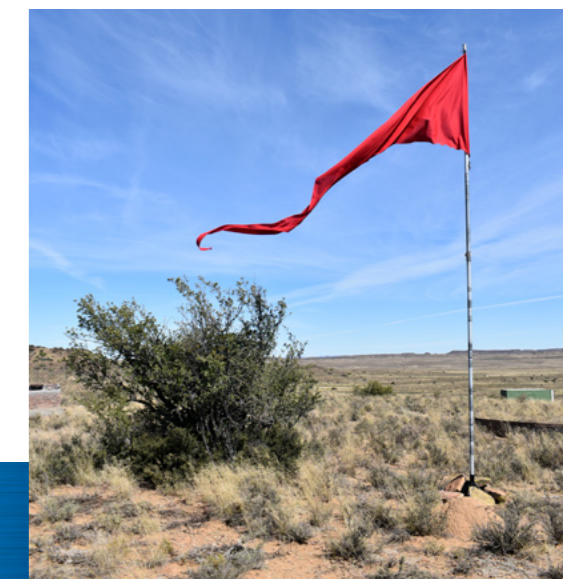
Day 1, 28 April 11:20